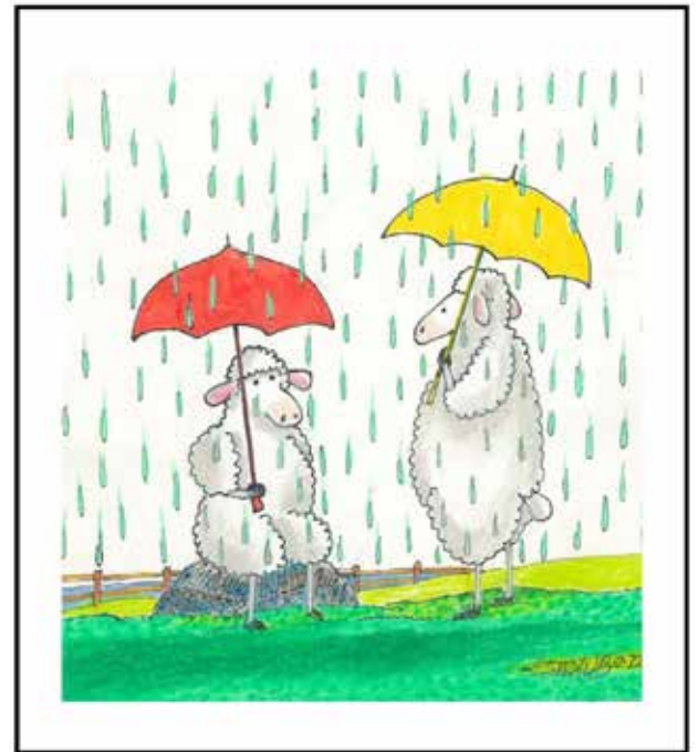
Do Sheep Shrink When It Rains?