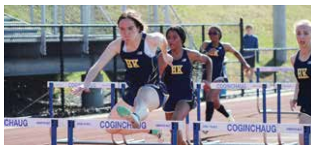
Continued on page HK2

On Tuesday, April 12, the Haddam Killingworth High School boys and girls track teams opened their seasons as they traveled to Durham to compete in a tri-meet against Coginchaug and Old Lyme. Both the boys and girls teams came away with two victories on the day as the boys defeated Old Lyme by a score of 116-38 and Coginchaug by a score of