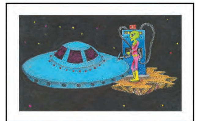
The Sky High Price of Gasoline