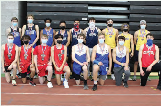
Photos from Shoreline Conference Meet