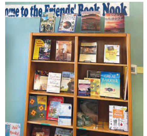
The Book Nook, one of many projects courtesy of The Friends.