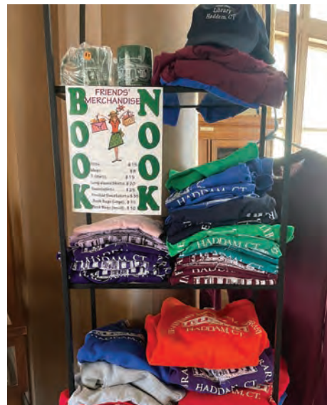
The Friends' Merchandise.