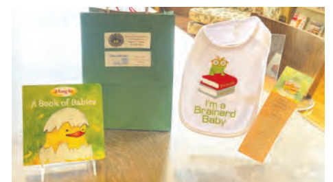
New Baby Gift Swag, courtesy of The Friends.