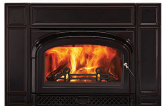
MONTPELIER II Wood Burning Insert

FREE ESTIMATES...BEST SELECTION...LOWEST PRICES...COMPLETE INSTALLATION