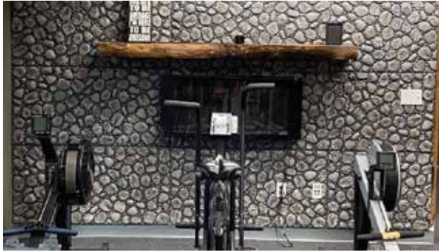
You can exercise in front of a fire.