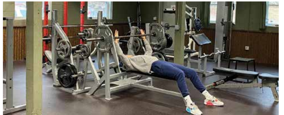
Weight room.