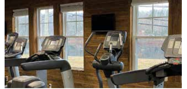
Or exercise looking out over the Reservoir.

is located at 66 Killingworth Road, Higganum, directly across from the reservoir and in front of The Truck Bar. You can find contact information, pricing, and keep updated on their website at www.hkhealthandfitness.com or on Facebook at HK Health and Fitness.