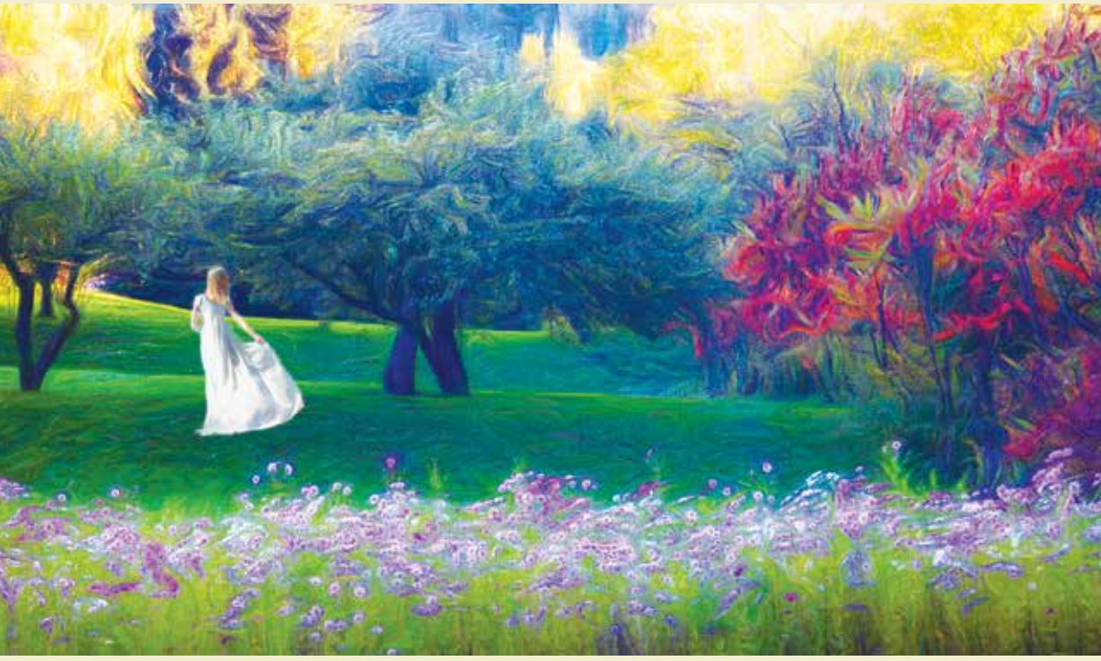
A Dream of Heaven, archival digital photograph, Colleen Reilly.