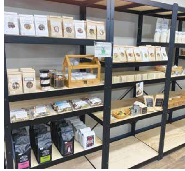
Local items from around the state.

In This Issue: Calendar, HK2, • Medicare News, HK5 • Local Arts, HK9