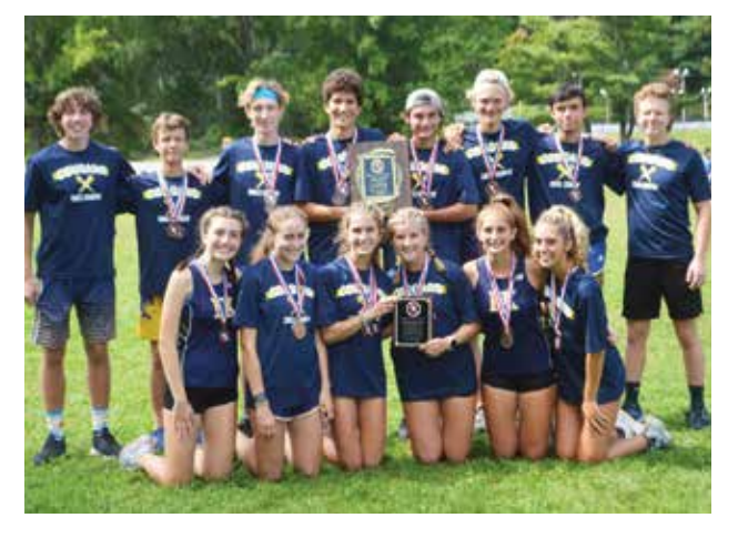
The boys & girls varsity team with plaques at Suffern Invitational.

In This Issue: Sports, HK2-3, HK8 • To the Editor, HK6-7 • Connecticut News, HK9