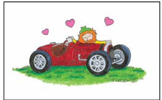
A Car Crush