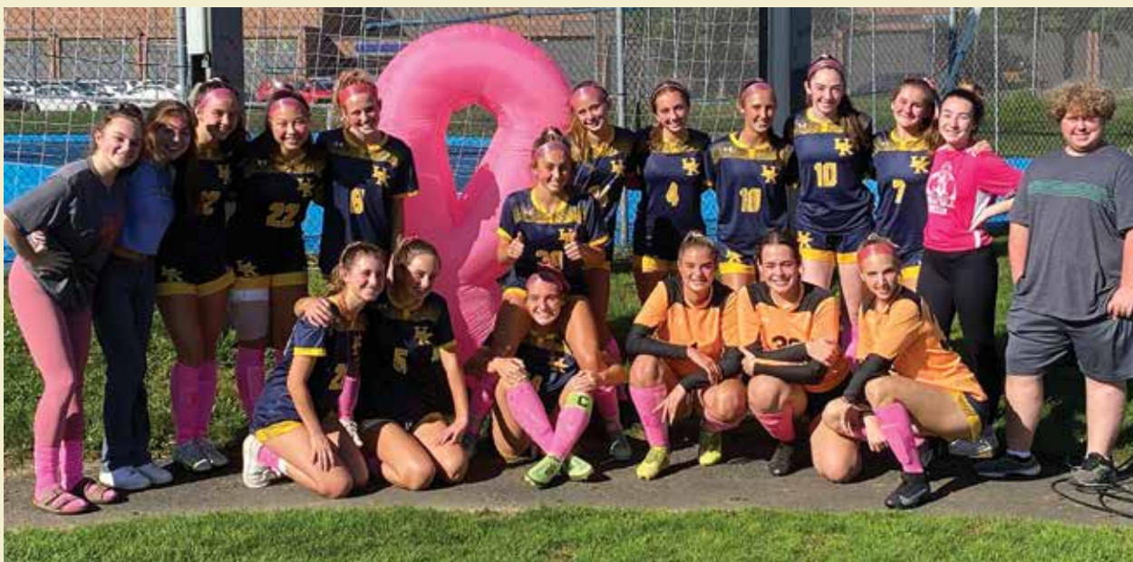
2021 Haddam-Killingworth Girls Soccer team.