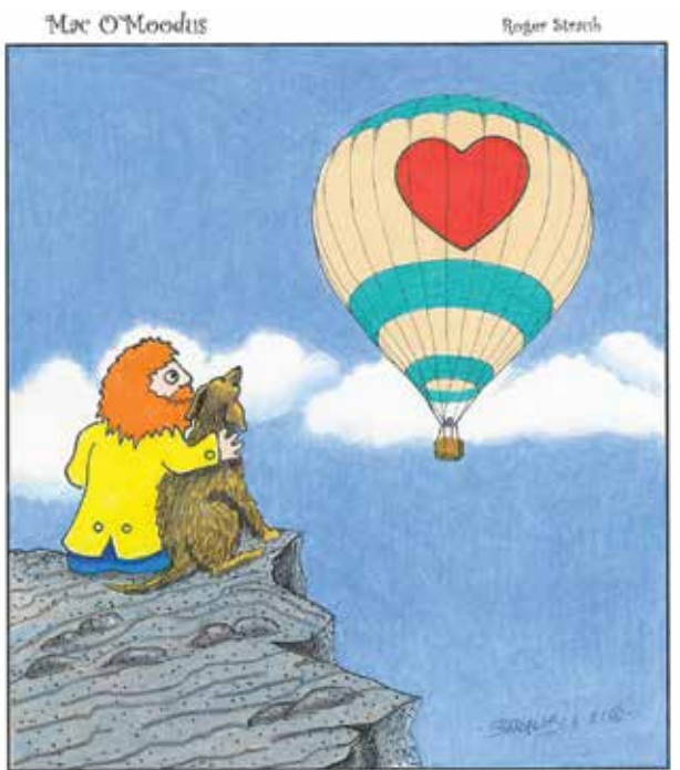
Love is in the Air www.redshedstudios.com