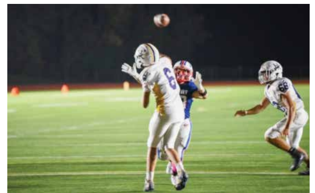
Oct. 22.