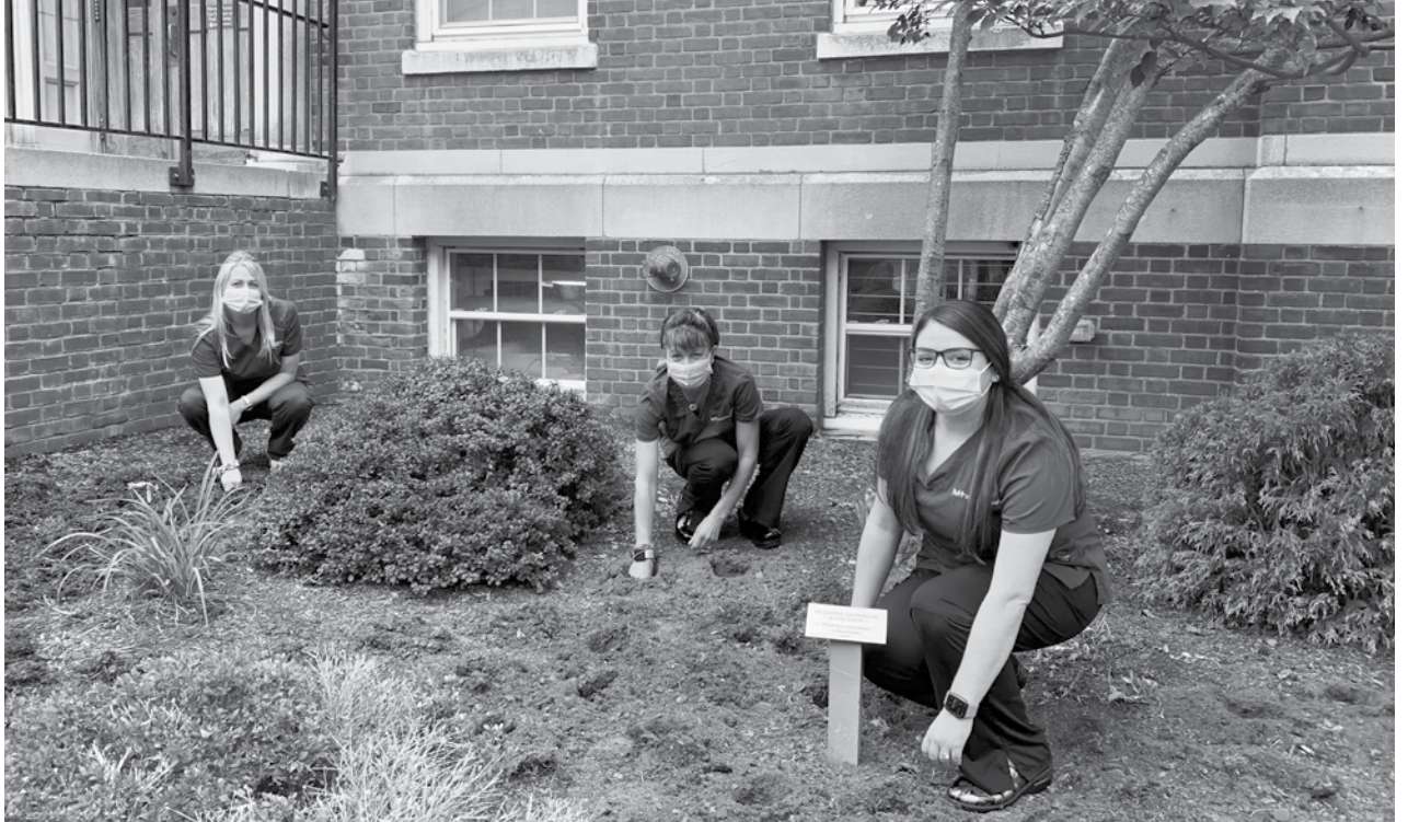
Middlesex Health staff