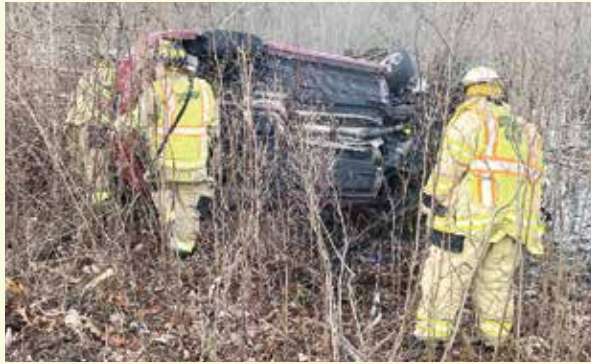
Beaver Meadow Rd. accident.

In addition, at 7:00 a.m. on Nov. 27, crews were dispatched to the south end of Beaver Meadow Road where a vehicle was found rolled over in a