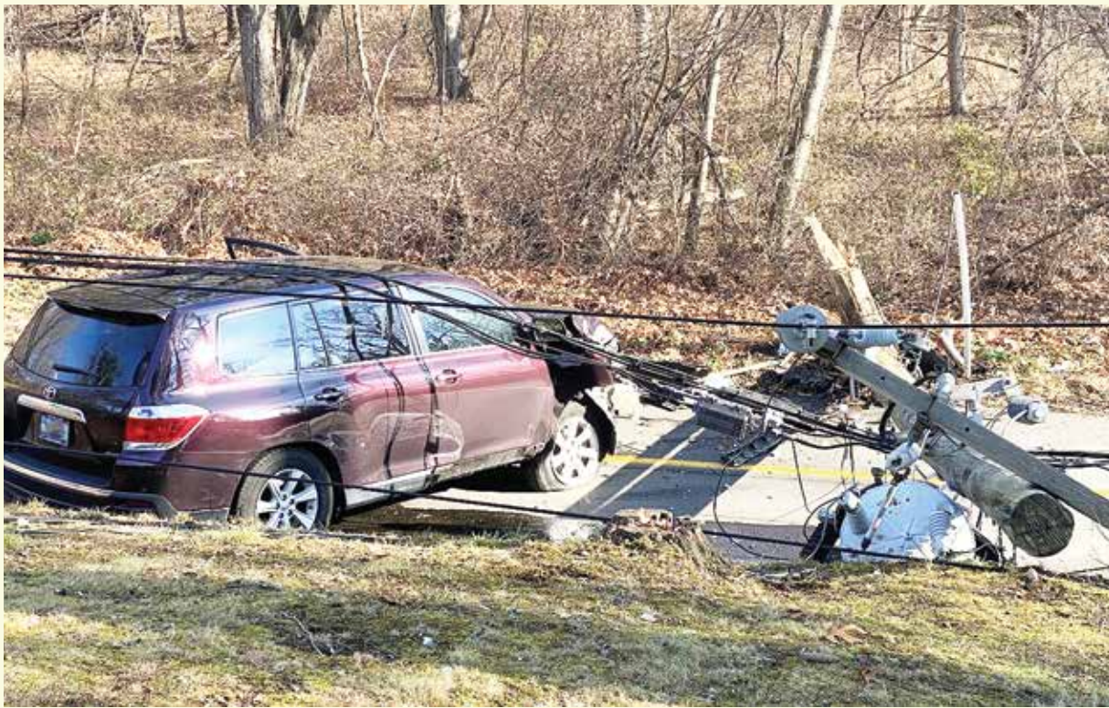
Hayden Hill Rd. accident.

These incidents mark the 10th and 11th motor vehicle accidents that HVFC has responded to during the month of November.