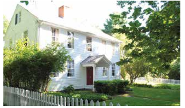
The Ezra Kelsey House, Saybrook Road, Higganum