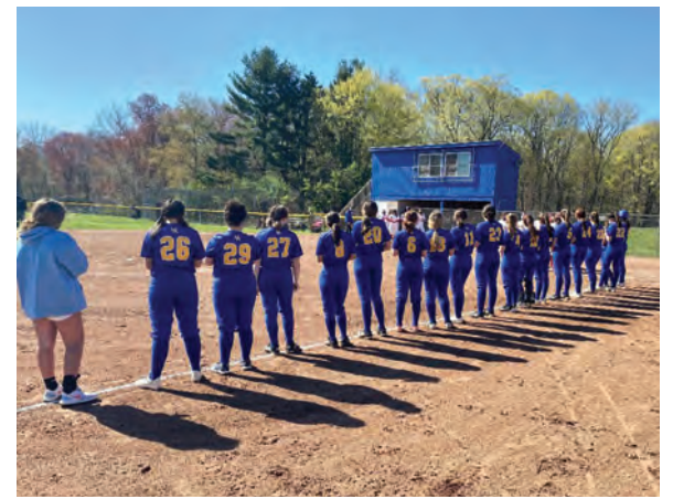
Pre-game introduction of the HK Softball Team.