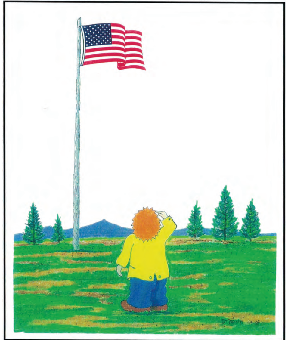
No Need For Greed