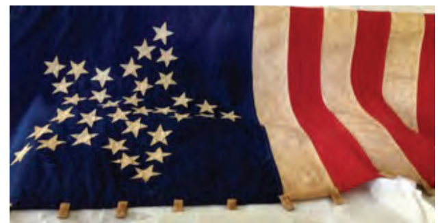
Flag still in KHS's possession