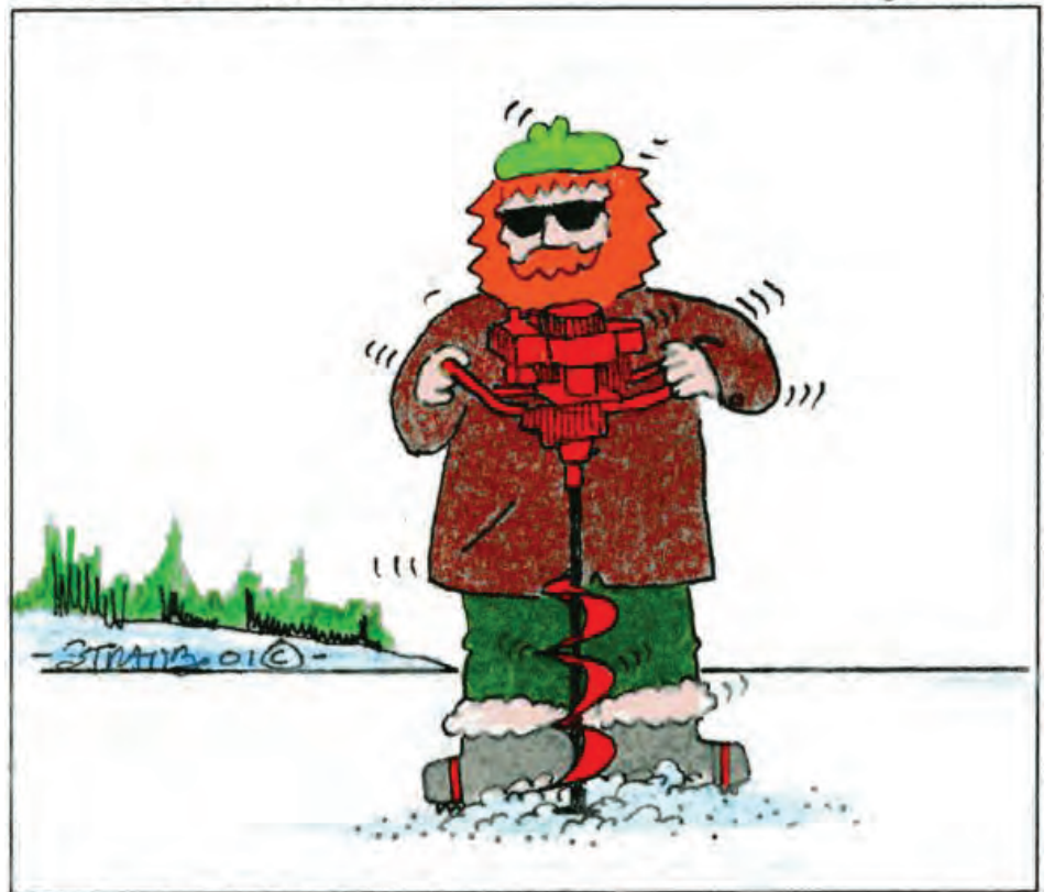
The Turning Point

For all things Mac O' Moodus please visit redshedstudios.com