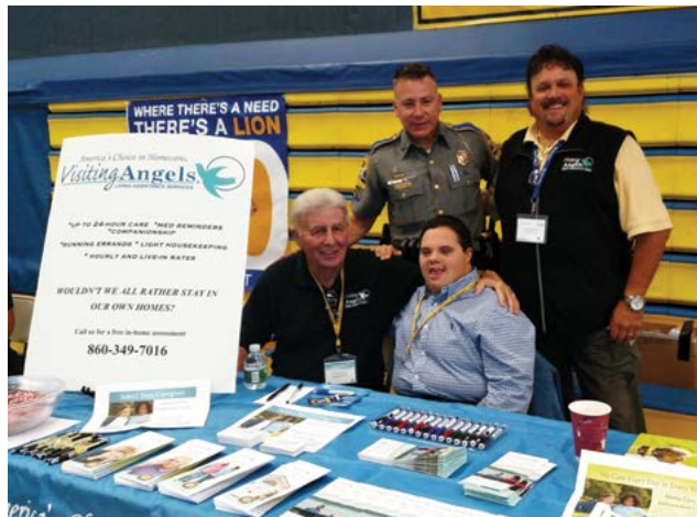
Senior Expo 2017.