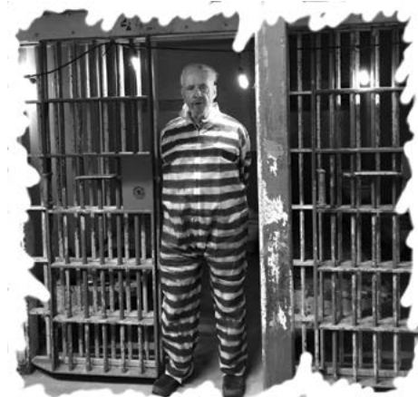
Information visit www.haddamhistory.org or call 860-345-2400.