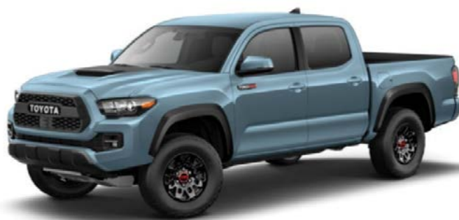
TOYOTA 2018 TACOMA