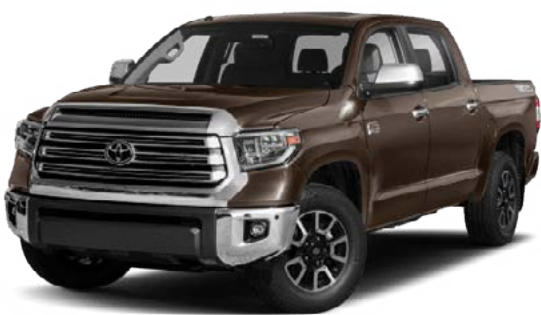
TOYOTA 2019 TUNDRA