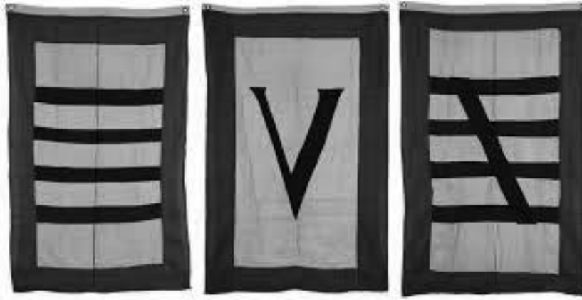
Beginning to End flag.

Middletown, June 6, 1919: Beginning June 9th,