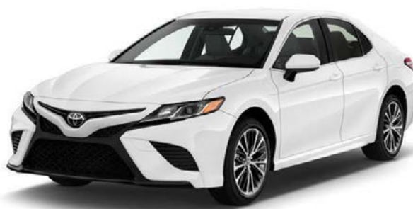
TOYOTA 2019 CAMRY

2 years or 25,000 miles free service with any new Toyota Bring in this ad for a $500 discount!