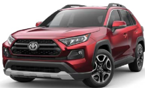
TOYOTA 2019 RAV4