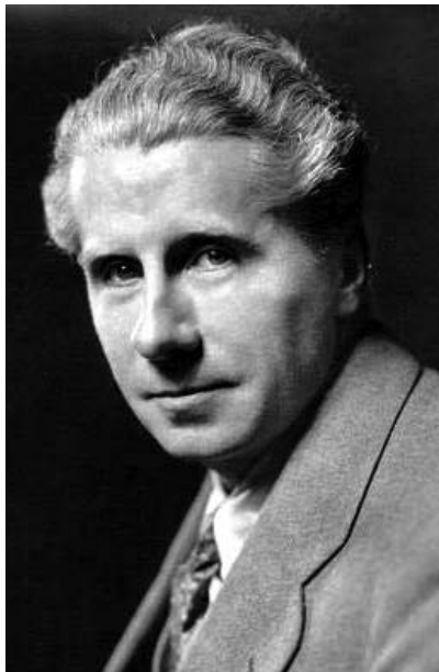
Hugh Lofting.

who was born 134 years ago this week on January 14, 1886. Lofting, a transplanted Brit, came to Massachusetts at age 18 to study engineering at MIT. After World War I broke out in 1914, Lofting, whose mother was Irish (maiden name Gannon), joined the Irish Guards of the British Expeditionary Force (BEF) as a lieutenant. As a frontline unit, the Irish Guards participated in many of the fiercest battles of the Great War. Rudyard Kipling's only son, John, was also a lieutenant with the Irish Guards. John Kipling was killed at the Battle of Loos in 1915. Hugh Lofting was wounded in the thigh by shrapnel from a hand grenade in 1918 and nearly died. Before being wounded, however, Lofting had written several letters from the trenches in France to his two