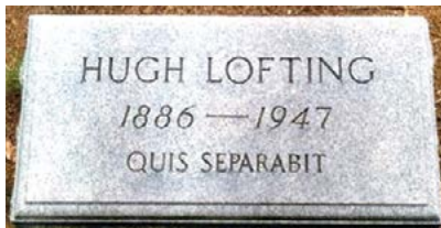
Lofting's gravestone.