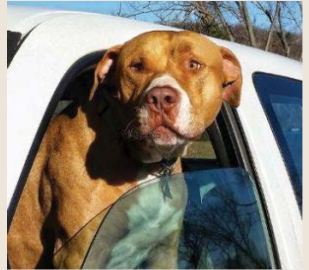
This column has become a reader favorite. Here are some highlights from the last two weeks at the Haddam Transfer Station, where everyone loves to bring their dogs.