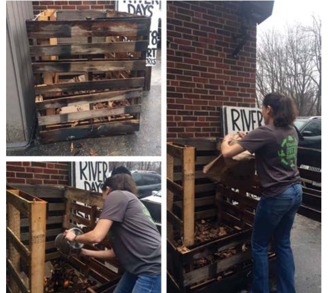
Compost bin at Town Office Building.