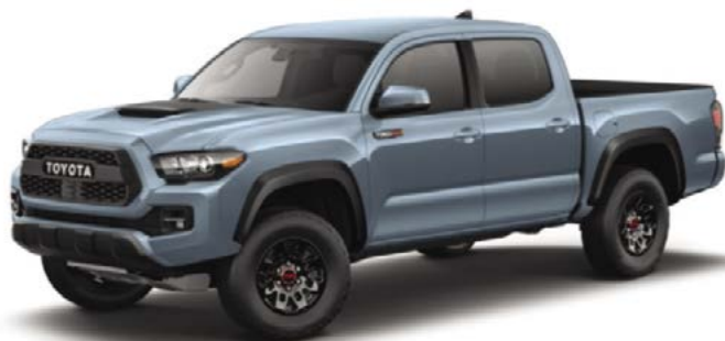
TOYOTA 2018 TACOMA