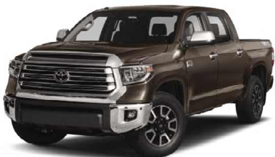
TOYOTA 2019 TUNDRA