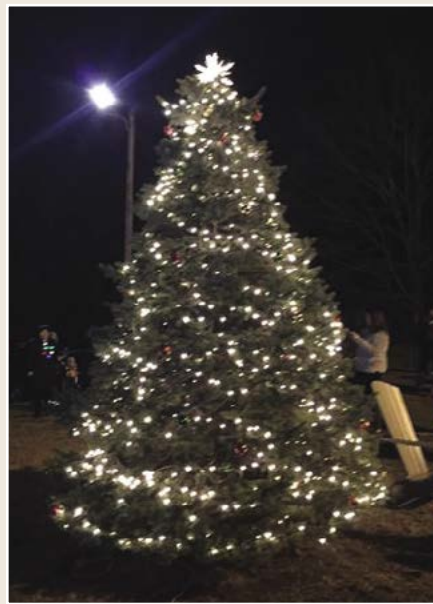
Above: Below