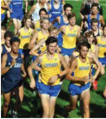
Above: Start of the Boys race.